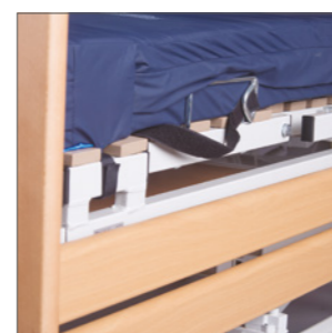
Full length wooden safety sides