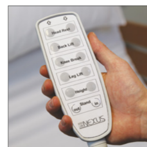
Intuitive hand set