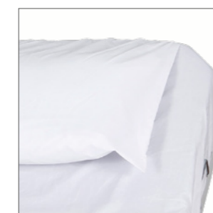
Fitted sheets with integrated pillow case