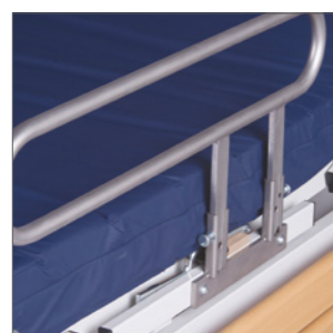
Three quarter length safety hand rails