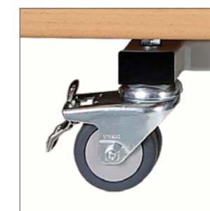
Individually-braked twin wheeled castors