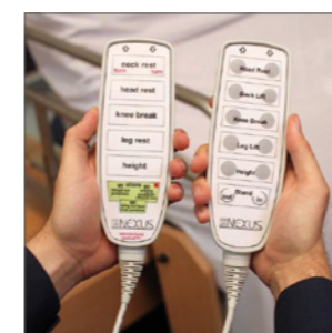
Service hand control