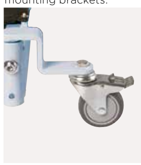
Lowering kit Using castors of 75 mm creates a lower height of 250 mm.

Foldable steel side rail with plastic inserts at the mounting brackets.*