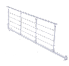
Invacare Scala Medium 2 Foldable steel side rail for higher mattresses.*