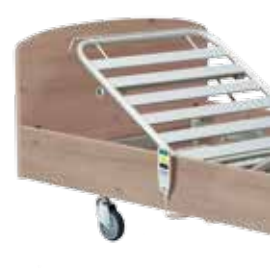
*Wooden side panel

be Can used in combination with Scala Basic Plus 2 side rails. Available in light oak only.