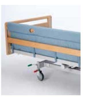
Cover for wooden side rail Padded cover for wooden side rails. Cover remains in place when side rail is lowered.

Available beech. in Compatible with full length side rails.