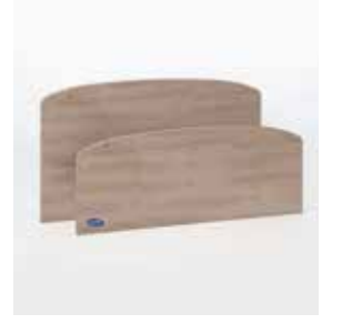
*Olivia bed ends

Can be used in combination with wooden side panel. Available in light oak only.