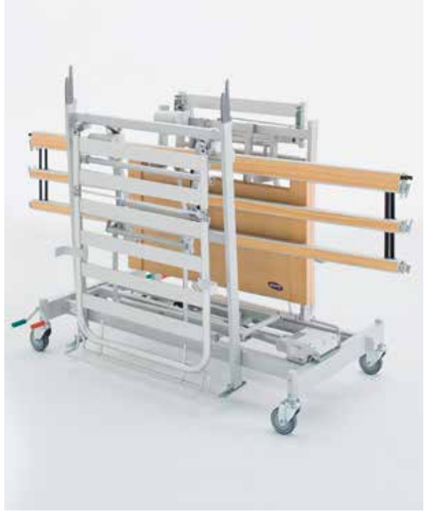
Bed parts, mattress and accessories are stored directly on the base with special hooks; storage and transport are facilitated and the bed takes up less space.