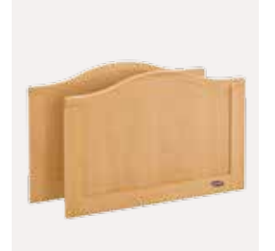
Anita bed end

Available beech. in Compatible with full length side rails.