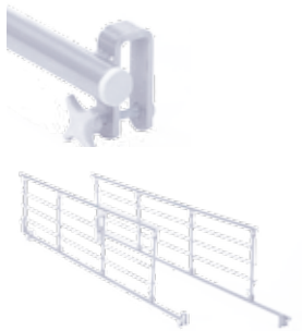
Invacare Scala Basic Plus 2

Foldable steel side rail with plastic inserts at the mounting brackets.*