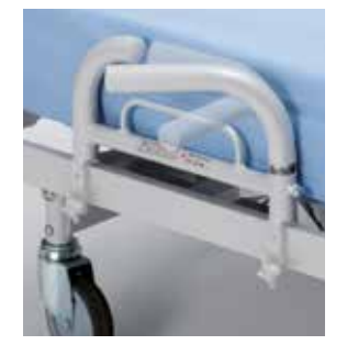
Swivel support handle The swivel support handle provides good support for the client getting to a standing position.

Can be used in combination with wooden side panel. Available in light oak only.