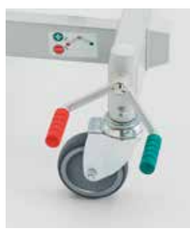
Central brake Available as standard.

*Compliant with the new standard for beds IEC 60601-2-52.