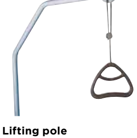
The handle can be adjusted both in height