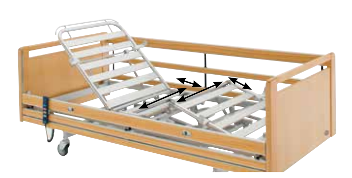
Optimised dimensions of mattress platform according to anthropometrical measurement, for increased comfort.