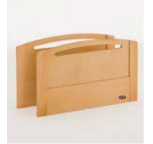
Victoria bed end Detachable panel _ Available in beech. Compatible with full length side rails.