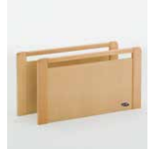
Susanne bed end Available in beech. Compatible with full length side rails.