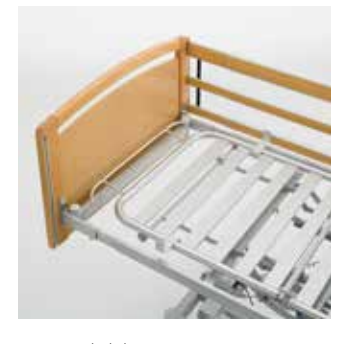
Extendable mattress platform. Additional 100 mm at head and foot. Bed easily extends with 50, 100, 150 or 200 mm to suit user needs.