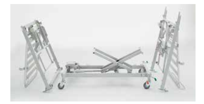
Activate the quick release and the scissor is detached. The handle makes it very easy to dismount.

The scissor is released from the base with the quick release handle.