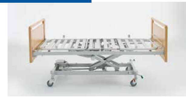
Bed ends can be dismounted without tools.