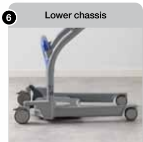
6 Lower chasis

New total-lock castors provide complete stability when the aid is stationary.