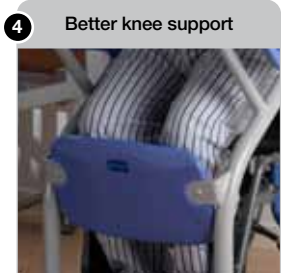
4 Better knee support

Handgrips integrated in the seat allow the carer to easily turn the support aid.