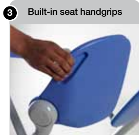
3 Built-in seat handgrips

Pedal-operated chasis legs adjust easily for optimum access during transfers.