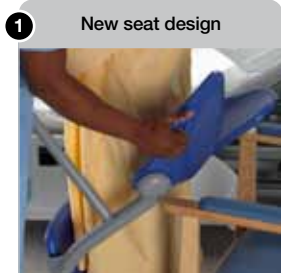
1 New seat design

The innovative pivoting seat improves transfer efficiency and patient stability.