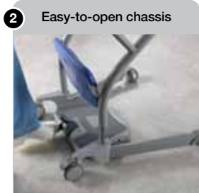
2 Easy-to-open chasis

The innovative pivoting seat improves transfer efficiency and patient stability.