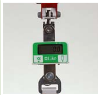
LikoScale with Quick-release adapter