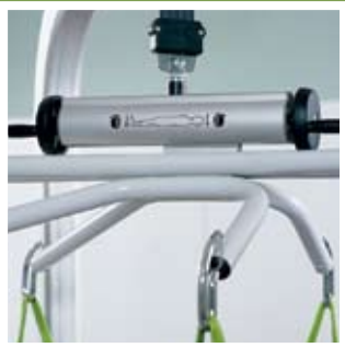
Lateral transfer stretcher with Stretch Leveller