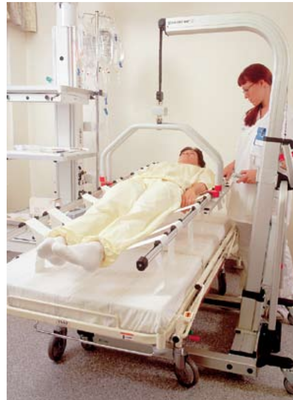
LikoStretch 600 IC Device

A Stretch Leveller is part of FlexoStretch system.