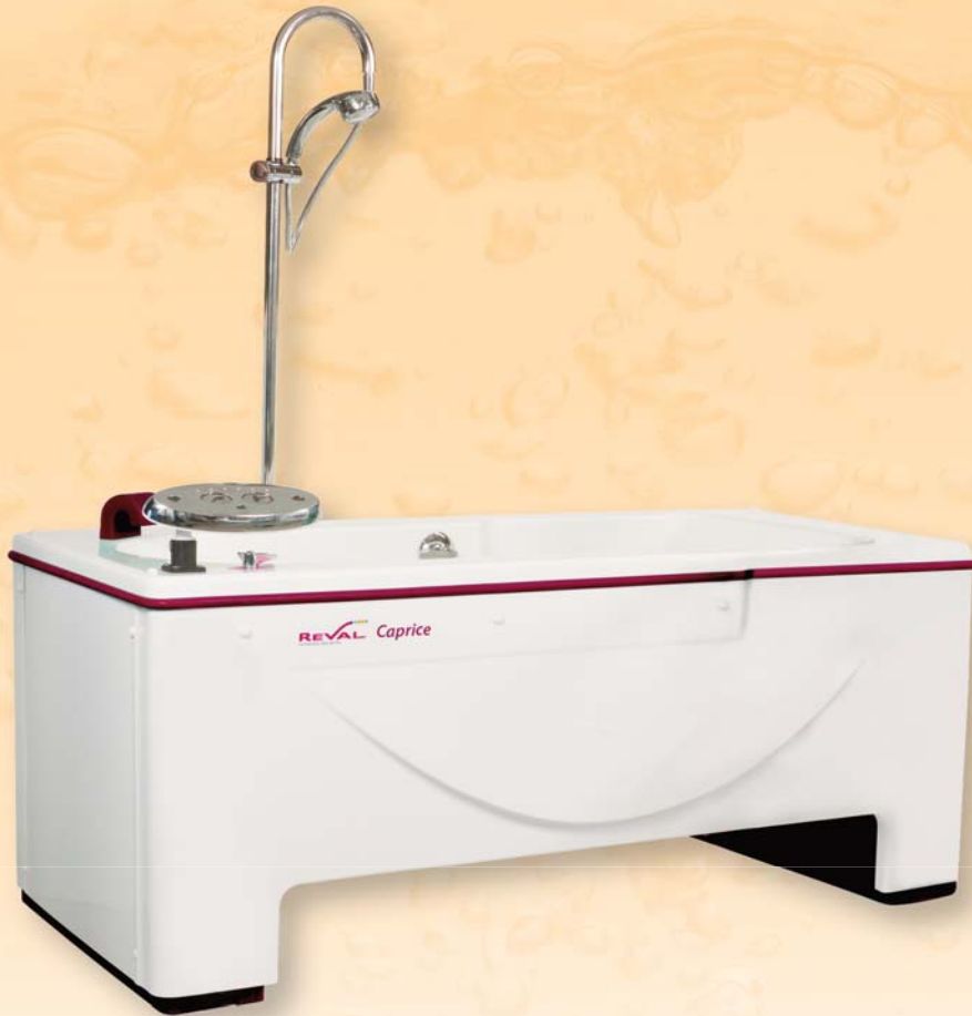
Fixed Height 7104.01 & 7104.02