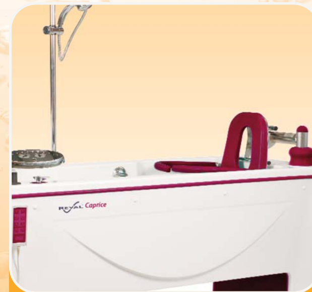
Integral hoist provides effortless transfers into baths