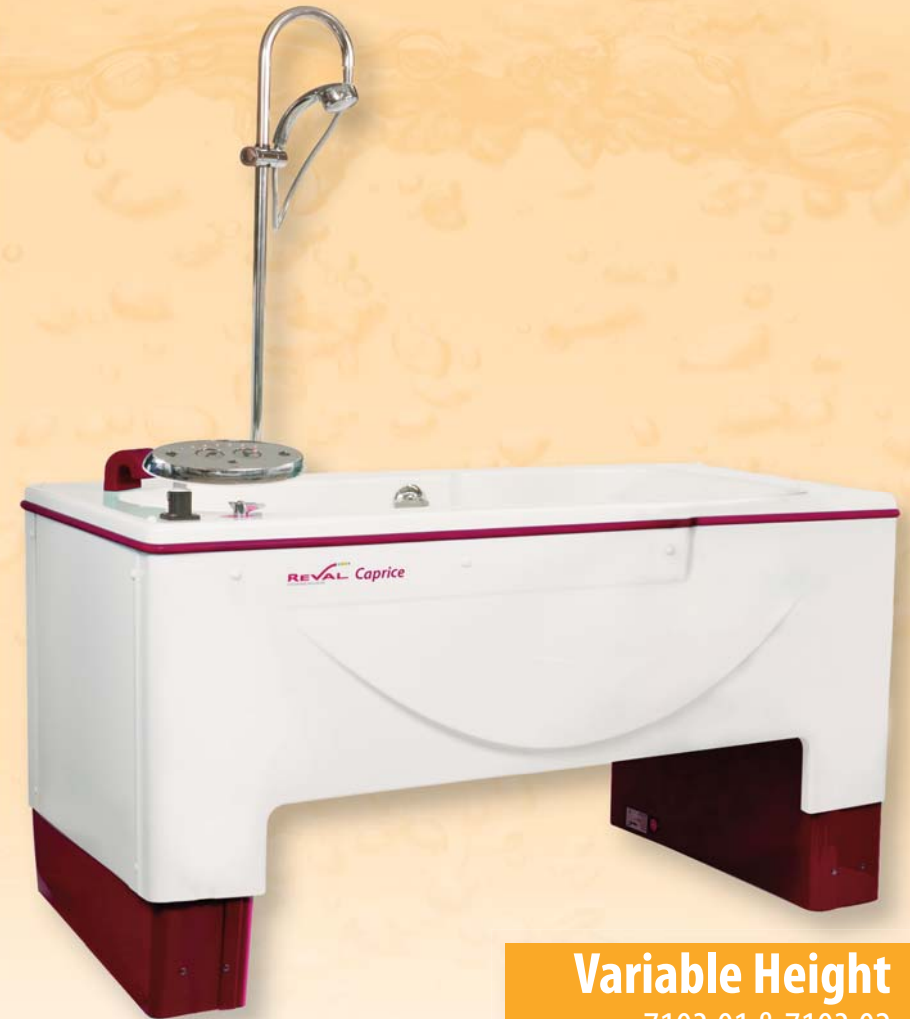
Variable Height 7103.01 & 7103.02

Caprice is made from high quality glass reinforced fibreglass for durability and is designed for industrial use, such as in hospitals and nursing homes. It comes complete with a 3 year warranty so you can be confident it provides long-term reliability and value for money for overall peace of mind.