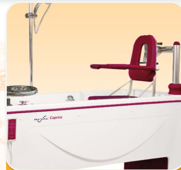
Integral hoist and seating system