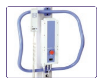
Over-sized push handle for improved handling and manoeuvrability.