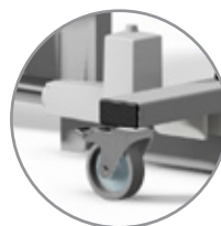
Large Castor Base